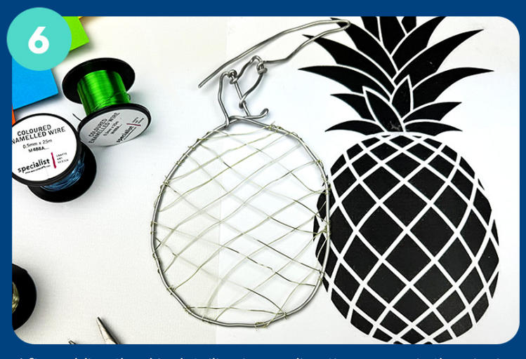
After adding the skin detailing in one direction, weave in the wire in the opposite direction to make a checked pattern.