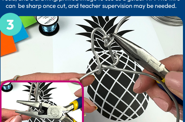
Next, add another piece of wire to the previous by wrapping it around the wire. Use the snipe nose pliers to do this as the wire can be stiff. To cut the wire, place the wire into the back of the pliers close to the base and snip (see close-up image).