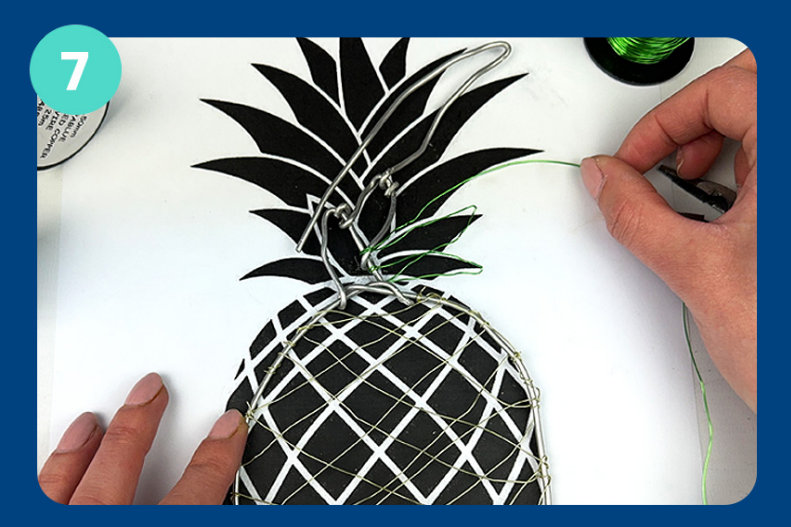
Next, using a different-coloured enamel wire, add smaller leaves by securing the wire onto the base silhouette. Use your printed design as a guide to bend it into shape.