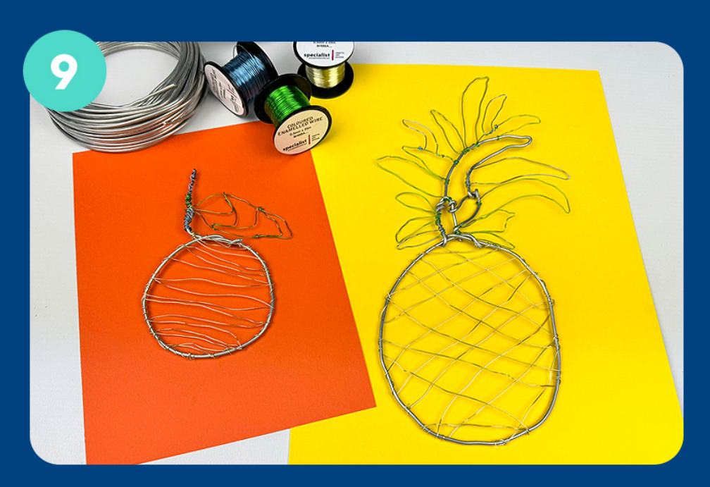
Finally, when you are happy with your designs, place onto a coloured card background to see your wire drawing come to life! They can be secured to the card by poking two small holes into the card, securing with wire and tieing in place.