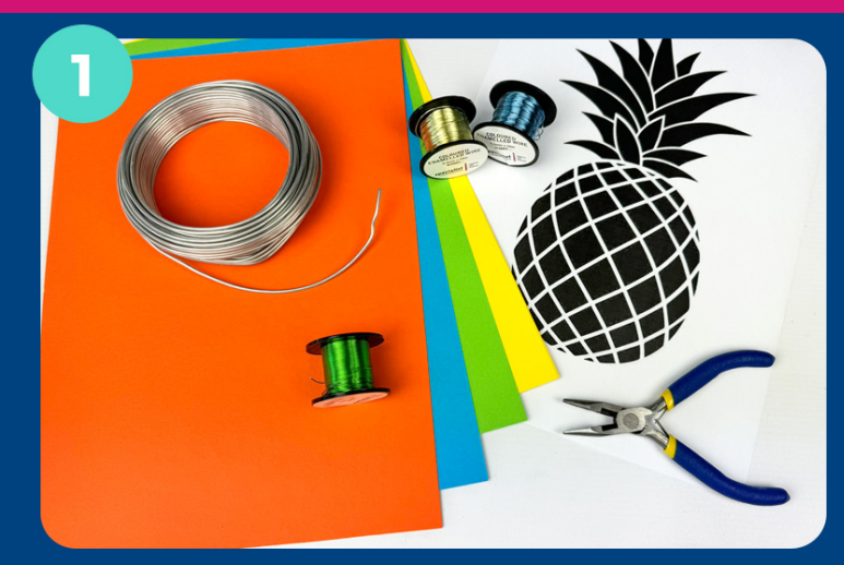
For this technique you will need: Assorted coloured card, snipe nose pliers, thin soft aluminium wire, assorted coloured enamel wire reels, and a drawing/printed image to use as a guide. TIP: The wire can be sharp once cut, and teacher supervision may be needed.