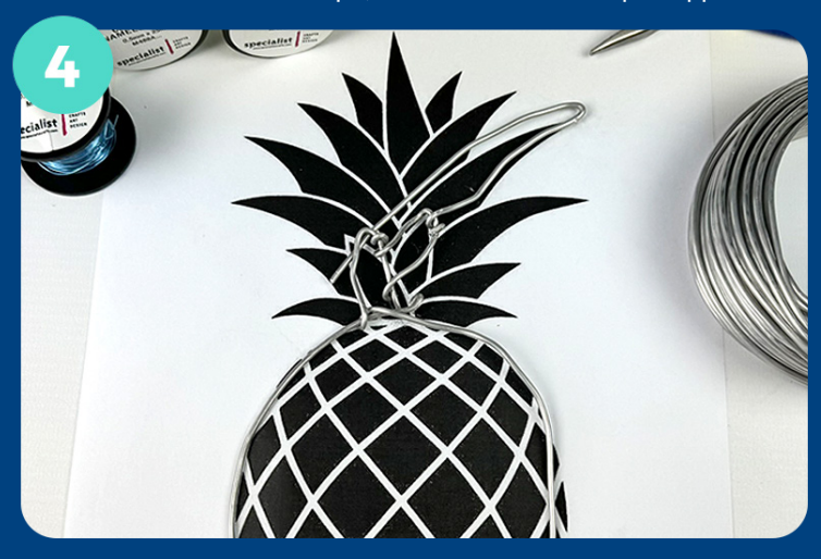
Repeat these steps to build up areas of the pineapple leaves you want to have a thicker outline.