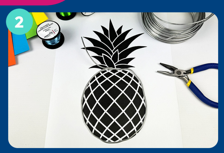
Start by cutting a piece of soft aluminium wire. This wire should be thicker than the enamel wire and form the base structure. Using a drawing or printed image of your chosen design, bend the wire around the outside shape, such as the base of a pineapple.