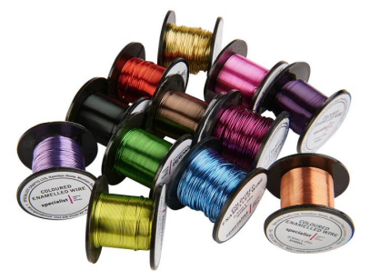
MT964A... Coloured Enamel Wire 0.5mm x 25m reels