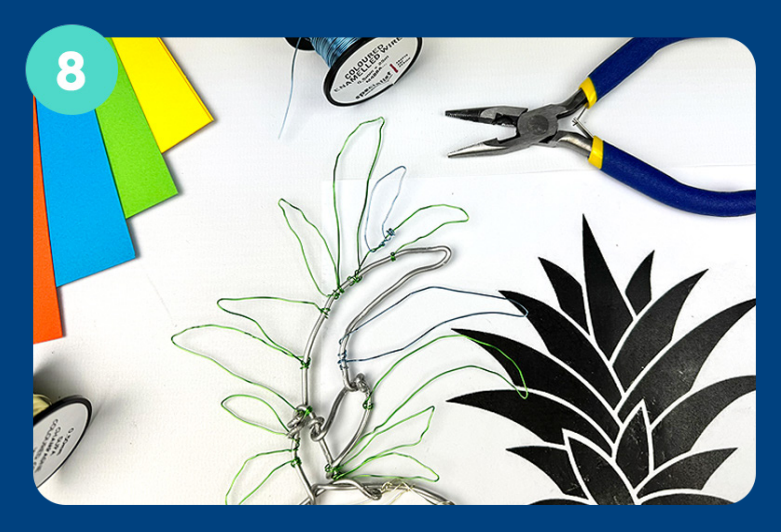
Once your pineapple is starting to come to life, use a second colour to add smaller leaf details by either securing them onto the base silhouette or the leaves in enamel wire. TIP: Remember to cut your wires down to the base to avoid sharp edges!