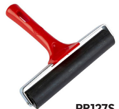
PR127S Standard Inking Rollers Set of 4