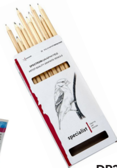
DP292 Spectrum Graphite Pencil Sets