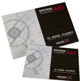
PB421A Spectrum Artist Tracing Paper Pad