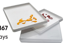
PA167 Painting Trays