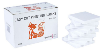
PR215 Easy Cut Printing Blocks