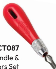
CT087 Lino Handle & Cutters Set