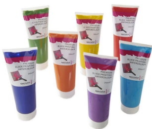
PR140A... Premium Block Printing Watercolours